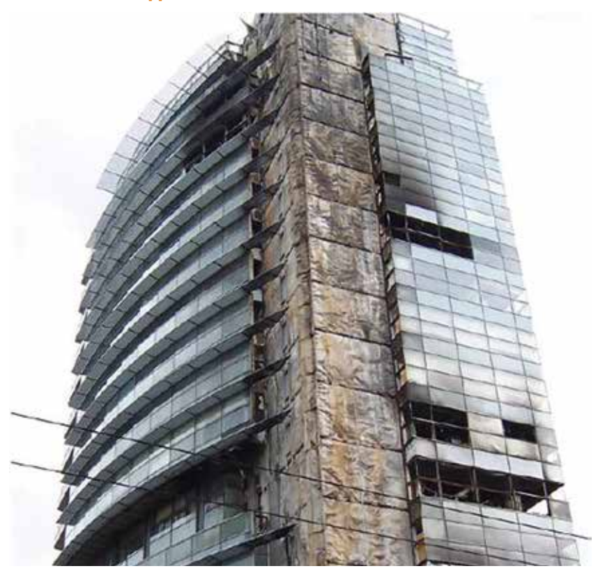
Combustible wall construction allowed fire to spread up the corner of this building.