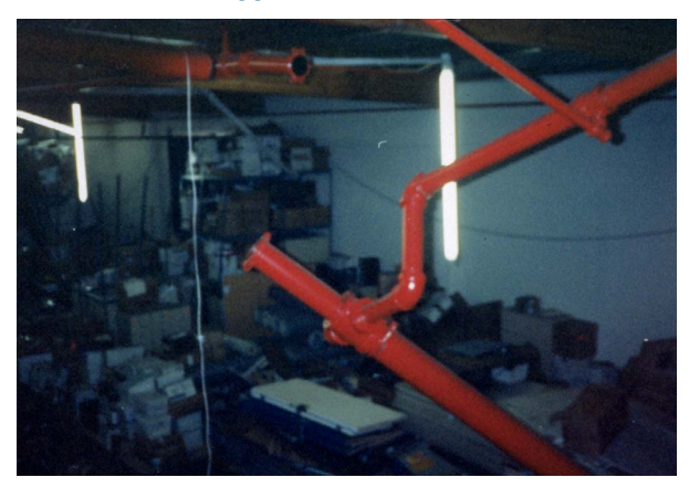
Inadequately-braced sprinkler mains catastrophically failed in the 1994 Northridge, California USA, earthquake.