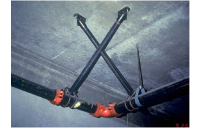
Proper bracing at change in direction

Remedying other deficiencies can further reduce the risk of fire protection system earthquake damage. For example, bracing suspended ceilings; modifying marginal pipe hanger attachments; and anchoring water supply equipment, water tanks and storage racks, may be needed in some cases.